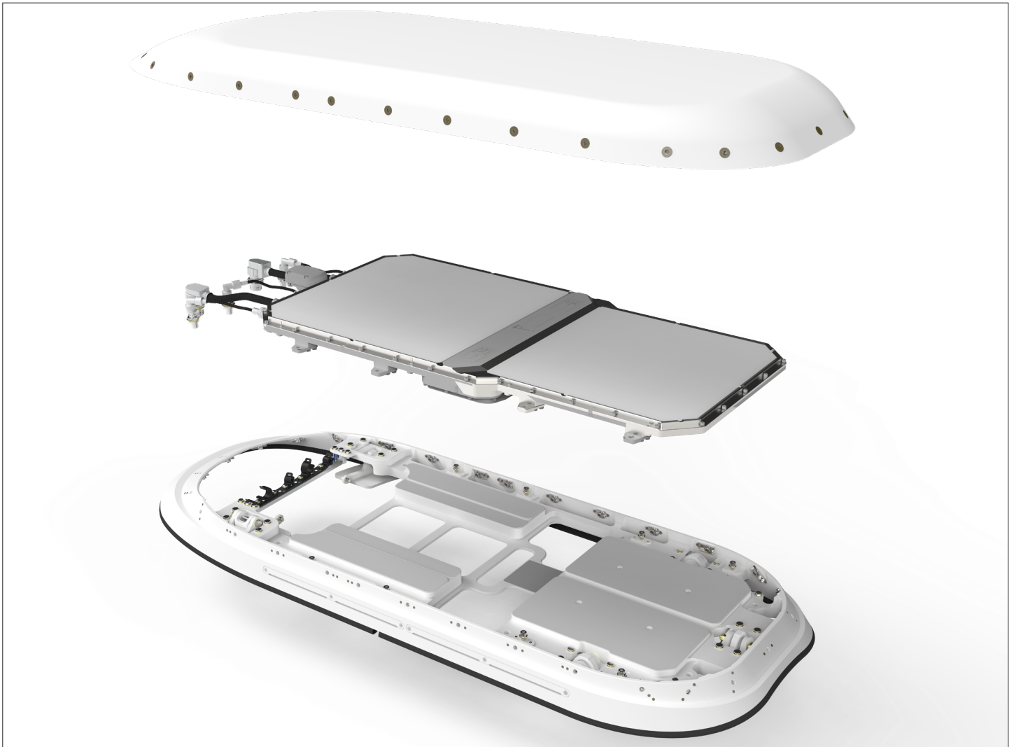
Exploded View of Galileo ESA OAE Installation Package