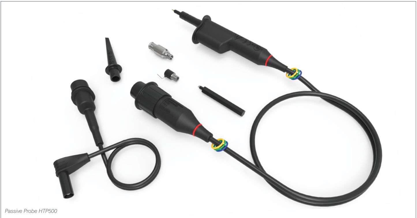
Passive Probe HTP500