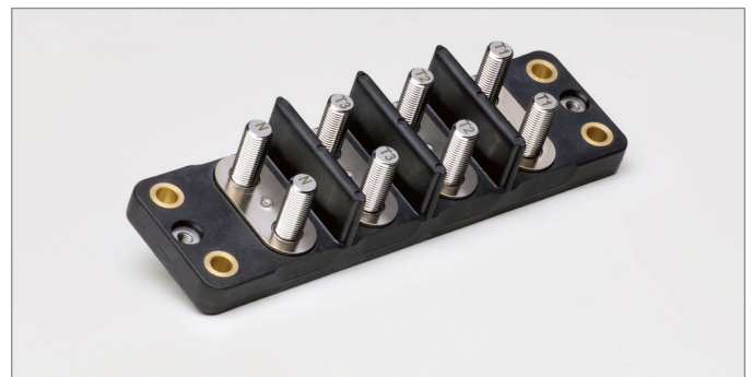
Cable assemblies can be combined and certified with terminal blocks, providing a complete solution to engine power feeder requirements.